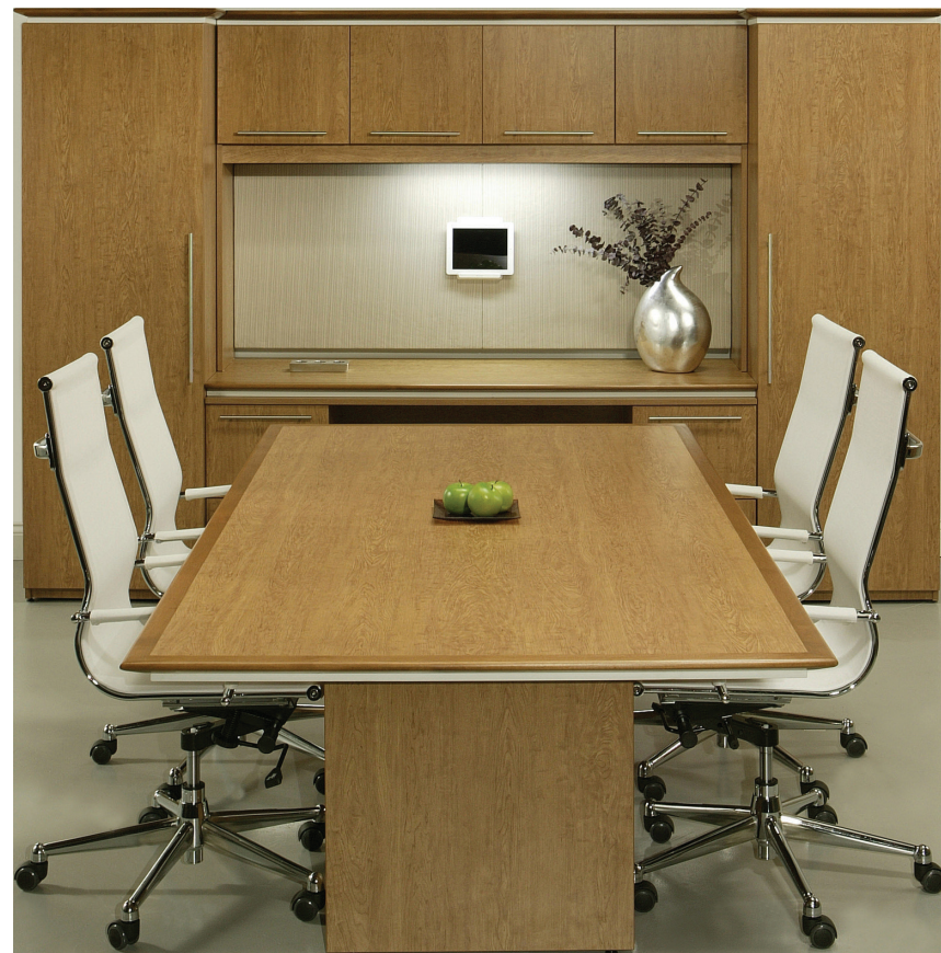
Honeyoak 1 1/8" Flush Tops with 1 3/4" New York solid wood trim in Honeyoak stain, 3/4" White Reveal strip under tops for floating effect, 10" Chrome handles on Hutch Doors & pedestals, 20" Chrome handles on storage cabinets